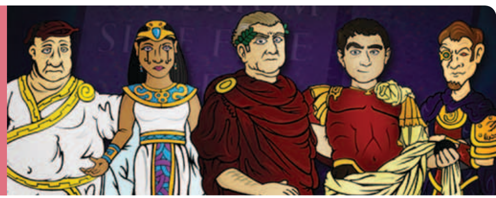
Original artwork from the Operation LAPIS interactive adventure in Latin. Learn more online at www.practomime.com.